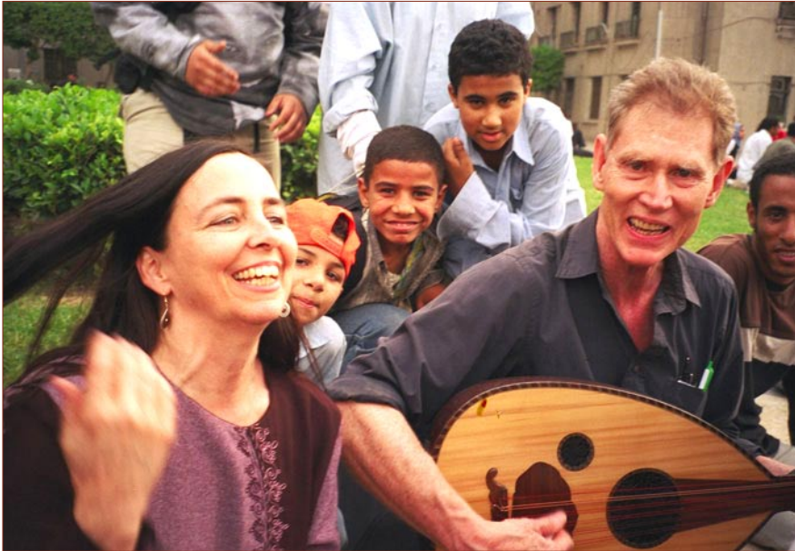
Singing in Tahrir Square, Cairo, March 2003